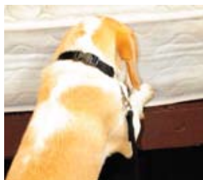
The nose knows...Scout sniffing out the giggahs.